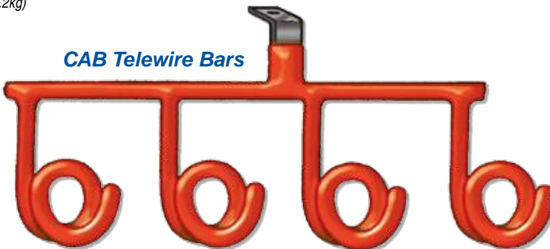
CAB Telewire Bars

CAB Telewire Bars are heavy duty multi-carrier hangers for roof installations. Top section made from .180" x 1" (4.6 x 25.4mm) safety edge steel and 5/16" (7.9mm) round stock. Bottom carriers made any diameter in closed loop (pictured) or open loop designs. Can be made with 1 to 10 carriers, custom to your specifications.