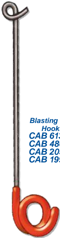
Blasting Wire Hooks CAB 6130 CAB 4801 CAB 205 CAB 199

Safe system for organizing sensor, communication, control and electrical wiring. Especially useful along conveyor beltlines and when running multiple cables.